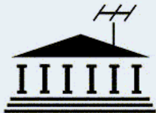
International Museums Weekend

(June 10, 2008 - js) The International Museums Weekend 2008 is taking place on the weekends of 14th & 15th June and the 21st & 22nd June 2008.