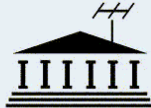
International Museums Weekend