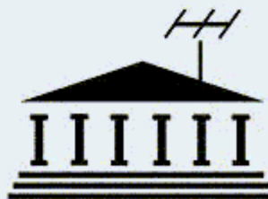
International Museums Weekend